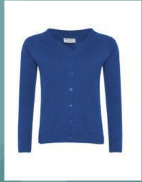
Royal blue jumper or cardigan