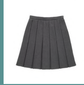
Grey trousers/grey skirt or dress