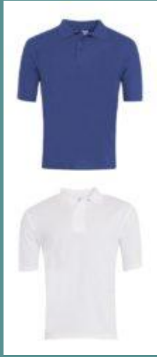
White or royal blue polo shirt